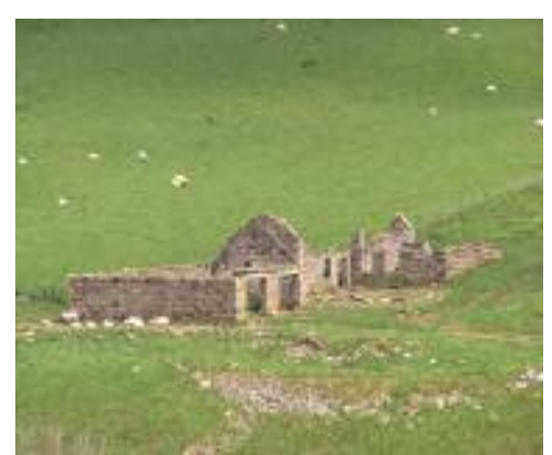
Fig. 6 Adjacent ruinous steading

25. As has been detailed earlier in this report, the description of the proposed development refers to a "replacement house for existing disused farmhouse and outbuildings." However, in assessing the proposal in the context of the policy on Replacement Houses in the Countryside, the proposal fails to comply. The existing house is not intact, is devoid of a roof and internal walls, and some of the external structure has also collapsed. It is clear that the property has not been inhabited within the previous five year period. Also as previously referred to, although an application for outline permission, the sketch included with the application details provides an indication of the scale and design of the dwelling envisaged by the applicants. A two and a half storey structure at this location would undoubtedly be far more intrusive in the surrounding area than the existing dwelling house.