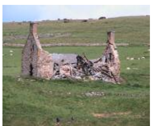
Fig.5: Ruinous dwelling

24. The proposed development is essentially for a new dwelling house on an exposed and elevated site in the countryside. The key issues to assess in this application relate to the principle of a dwelling house on this site in relation to development policies, and the particular merits, or demerits of the site in terms of general siting, visual impact, amenity, road access and the precedent, which such development may set.