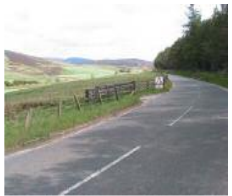
Fig.3 Visibility to the south