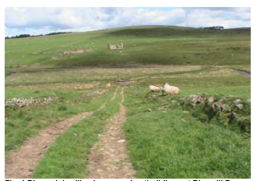
Fig. 1 Disused dwelling house and outbuildings at Bluemill Farm.

1. Outline permission is sought for the erection of a dwelling house as a replacement of an existing disused farmhouse and outbuildings. The subject site is located at Bluemill Farm on the Glenkindie Estate in the Strathdon area of the Cairngorms National Park. The proposed site is in an elevated and extremely exposed hillside location, approximately 470 metres to the east of the public road. The site area is 0.05ha and consists only of the land within the immediate confines of the existing disused dwelling house and adjacent outbuildings. The proposed site is surrounded by open agricultural land, used for grazing purposes, with the field pattern demarcated by traditional stone walls. In addition to the proposed dwelling house, details on the site layout plan also refer to the "existing outbuilding site converted to garage block and estate stores."