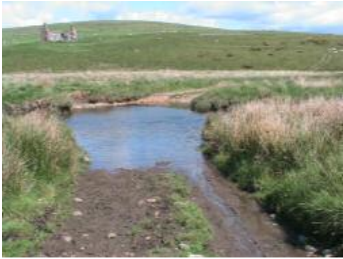
Fig.4 Access across Deskry Water

22. The proposal has also been discussed with representatives of the Upper Donside Fishery Board and they have highlighted the fact that the Deskry Water burn is an important fish-spawning tributary. Whilst